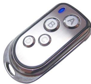
W-2 Wireless Transmitter

Wireless remote control system W-2 consists of a transmitter equipped with four buttons to activate, deactivate, increase and decrease fog output and an onboard receiver attached to the rear panel of FT-20 fog machine.